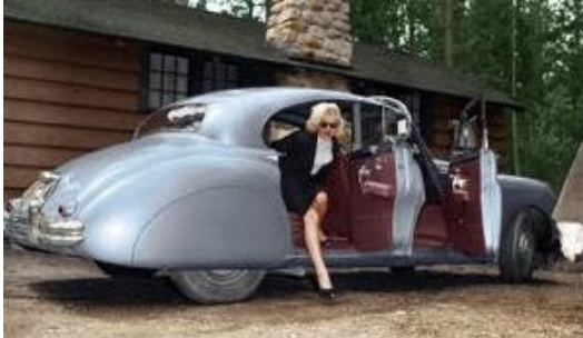
Marilyn Monroe stepping from a Mark V11 Jag