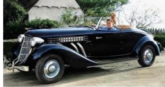
Errol Flynn with his 1935 Auburn