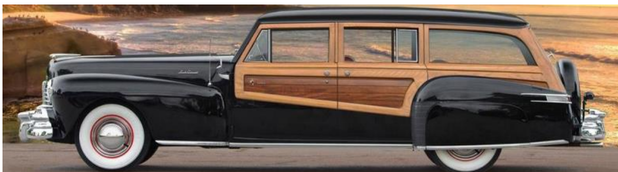
1948 Lincoln Continental

RoverNET is produced by the Rover Owners' Club (ROC) and acts as a route for advertisers to list cars and parts for sale. The ROC is not involved in any transaction between buyers and sellers. The ROC has no control over the quality or safety of the items advertised, the accuracy of the advertisements, the ability of owners to sell items or the ability of buyers to buy items. The advertisement details in RoverNET are based on information supplied by the advertiser and are presented in good faith. While every effort is made to be accurate, we give no undertaking that the details are correct. All advertisements for vehicles must include the registration number and/or if unregistered, the VIN/chassis number of the vehicle. Advertisements not following these guidelines may not be published.