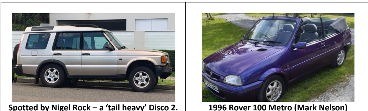
Spotted by Nigel Rock – a 'tail heavy' Disco 2.